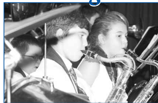
James A. Dever students performed holiday and winter songs for all to enjoy during their school's concert.

District Thirteen students have continued to demonstrate their desire to care for the community in a variety of ways this holiday season. James A. Dever donated toys to the John Theissen Toys for Sick Children program; Wheeler Avenue and Willow Road made donations to Toys for Tots; and Howell Road donated toys and other items for distribution within the community. The District's students also participated in a variety of food, clothing, coat and mitten drives. To further spread holiday cheer, the schools' musical groups performed locally at concerts, events, and hospital and senior citizen venues. Teaching children compassion is at the heart of the Valley Stream UFS District Thirteen Cares.