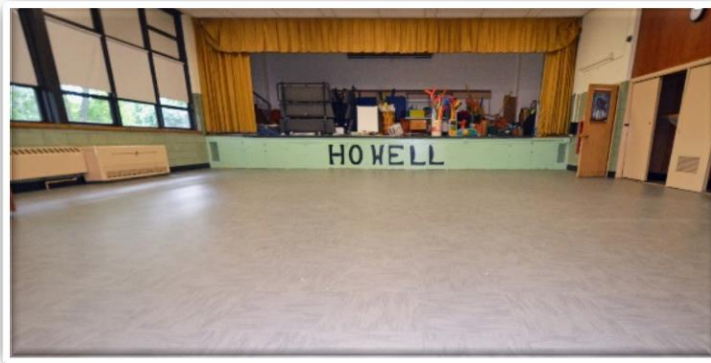
General Purpose Room