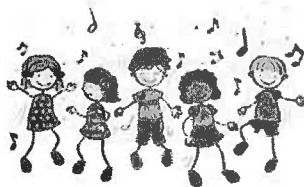
"Dance and DJ Party"