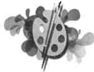
"Arts and Crafts"